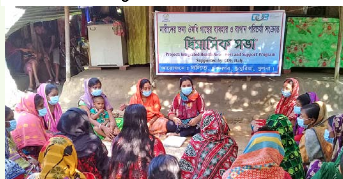
Meeting on nursing of medicinal plants garden