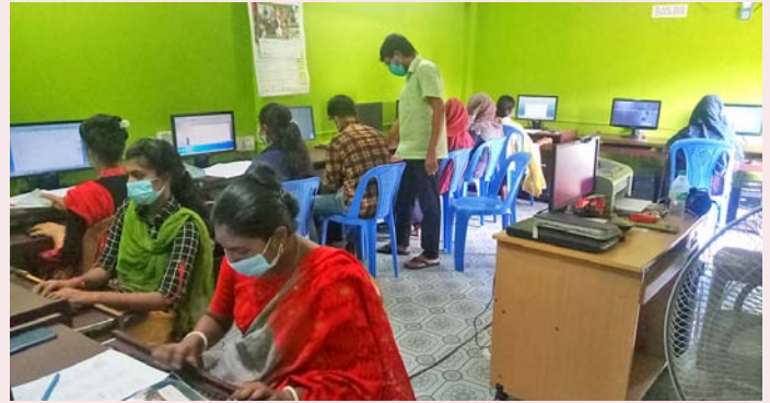
Training on computer programs