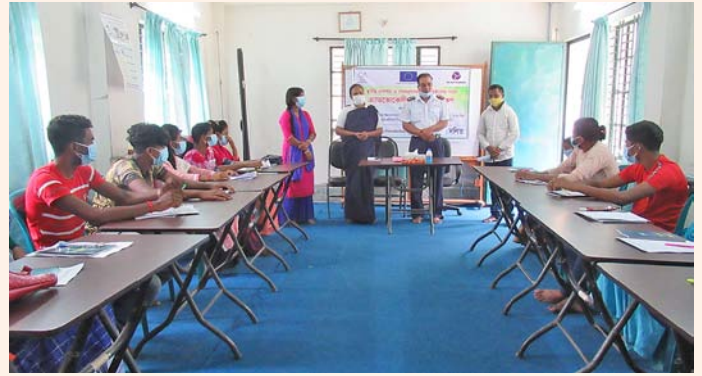
Training to the youth on advocacy