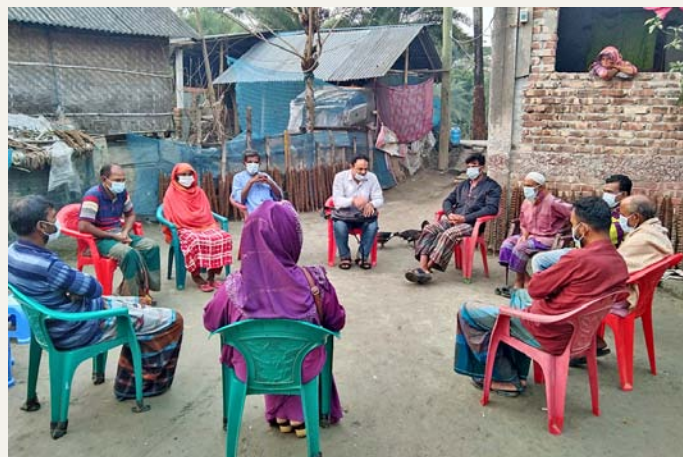
Meeting with Restorative Justice

By 2021 nearly 3.7 million cases were waiting to be disposed of at the courts, including the Supreme Court ( source: unb.com.bd ). To bring this situation under control, the Honourable Law Minister of Bangladesh and the Honourable Chief Justice of the Bangladesh Supreme Court are calling for cases to be filtered before they escalate into trial-worthy conflicts. In response to this call, Dalit has been conducting activities related to raising awareness about law, legal aid and resolution of disputes since 2021. Notable among which were: Coordination, communication and establishment of relationship with and among community level actors for legal assistance; Establish dispute resolution/Restorative Justice Mechanisms at the community level; Awareness raising on legal and social issues; Referral to legal assistance, social safety-net programs and other services as required.