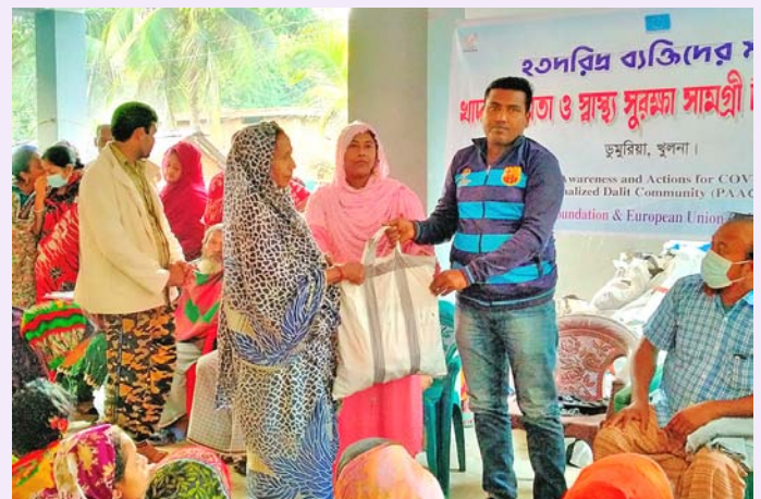
Distribution in Dumuria Upazila