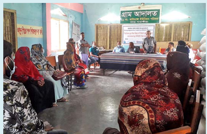
Meeting on the accessibility of WASH service