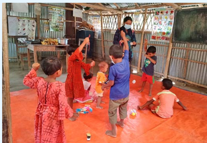
Child care centre in Manirampur, Jashore

Outbreaks of Covid-19 have increased the level of poverty in rural households, forcing all men and women in a family to work. As a result, their young children (kids) at home spend their days unprotected and helpless and have no opportunity for entertainment and education. To help parents overcome this problem, 3 child care centre have been set up at the village level since January 2021. The parents take their children to the child care centre at 8 am and go to work and at 1 pm they take their children home. During this time the child care centre assistant teaches children through entertainment and conducts activities that help them develop their talents. In addition to recreational lessons, children are also provided with light snacks.