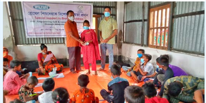
Special support to Brothel children