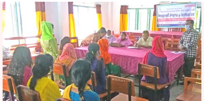
Meeting on child marriage prevention