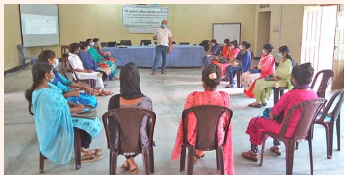
Meeting with Dalit Women Federation