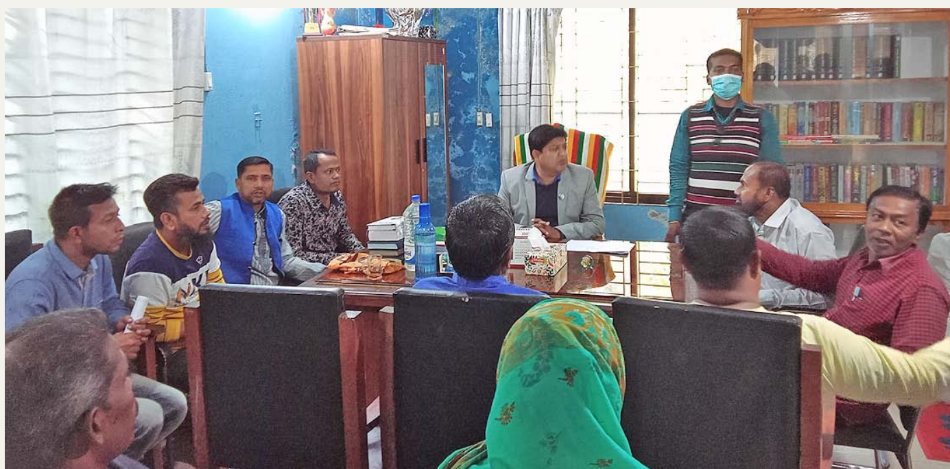
Meeting with the stakeholder