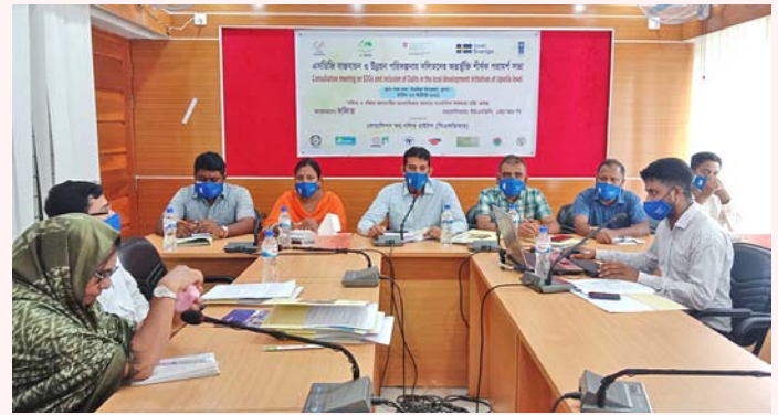
Meeting on inclusion of dalit in develop. program