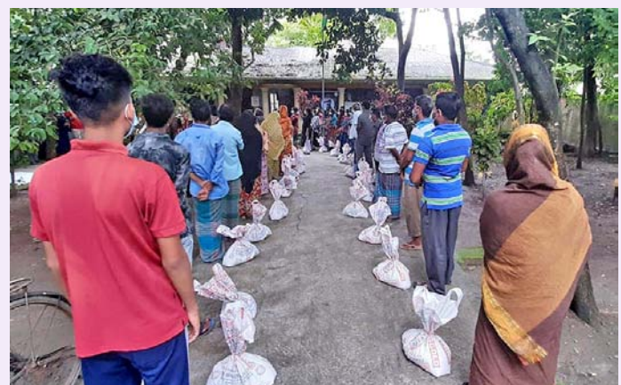
Distribution in Khulna city