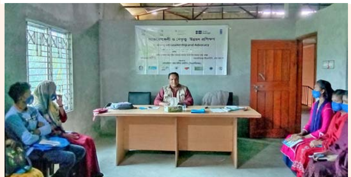
Training on leadership