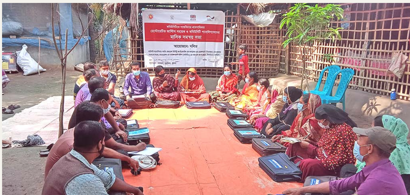
Coordination meeting of Restorative Justice Facilitator and Community Paralegal