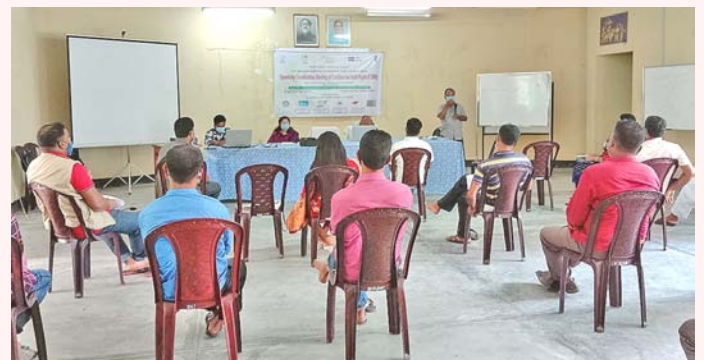
Coordination meeting of CfDR