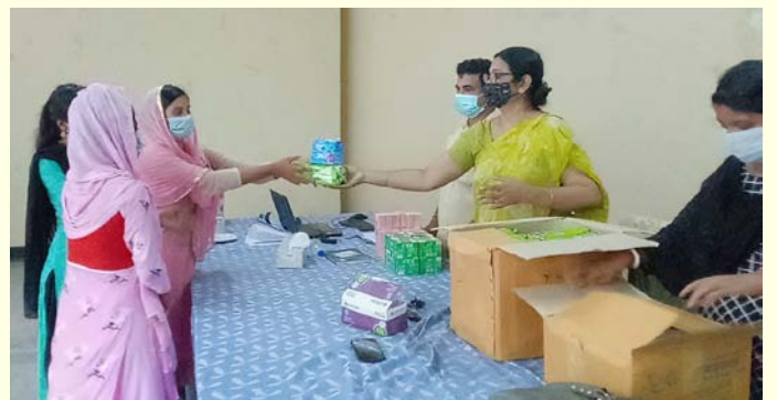
Distribution of sanitary napkin