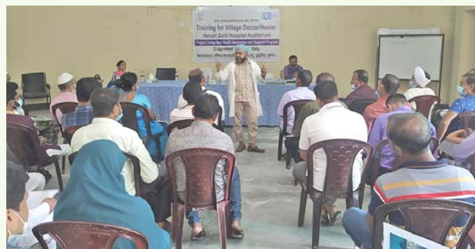
Training for traditional healers