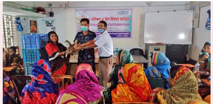
Distribution of duck