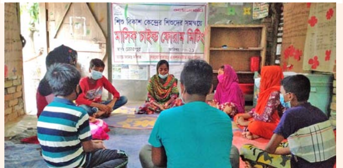
Meeting of Child Forum