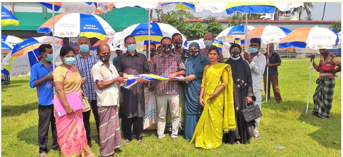
Umbrella distribution to the street shoe makers