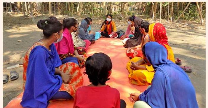
Courtyard meeting on leadership