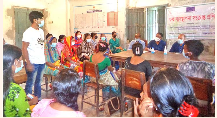
Training on conflict management