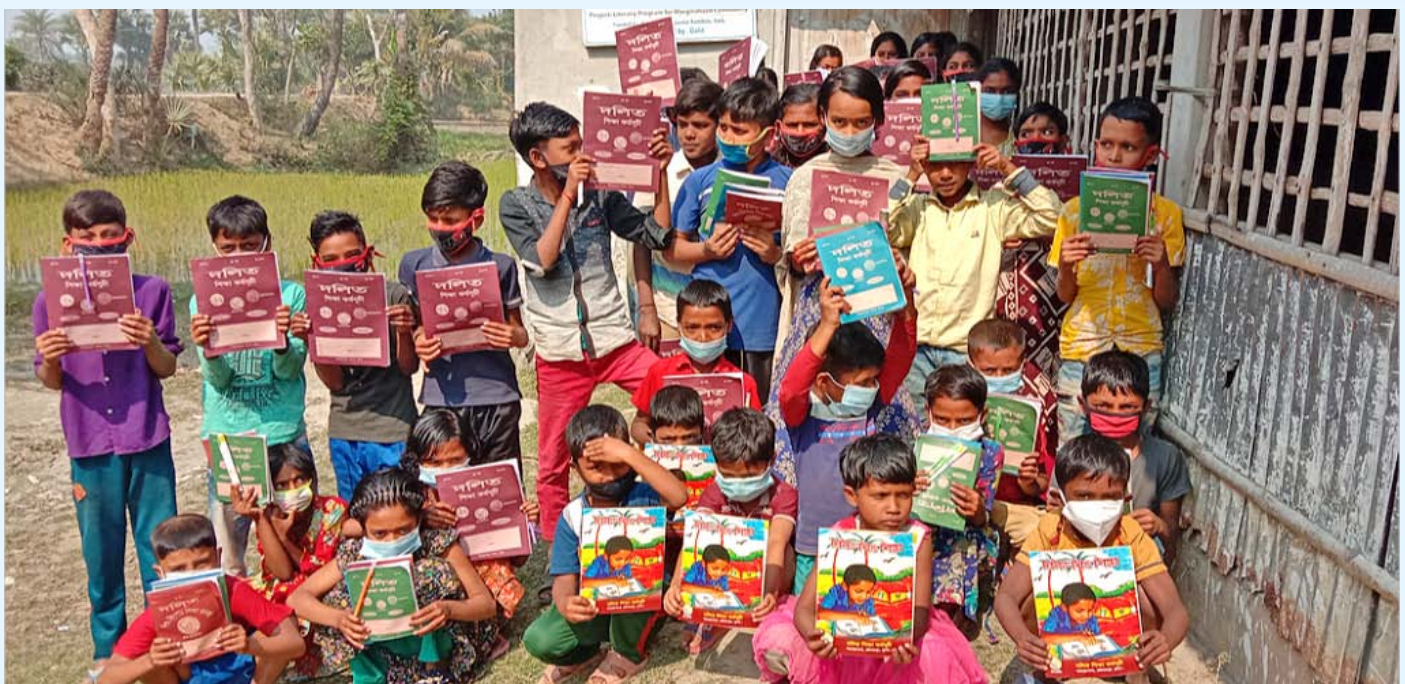
Distribution of teaching materials