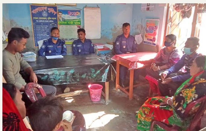
Meeting with local Police