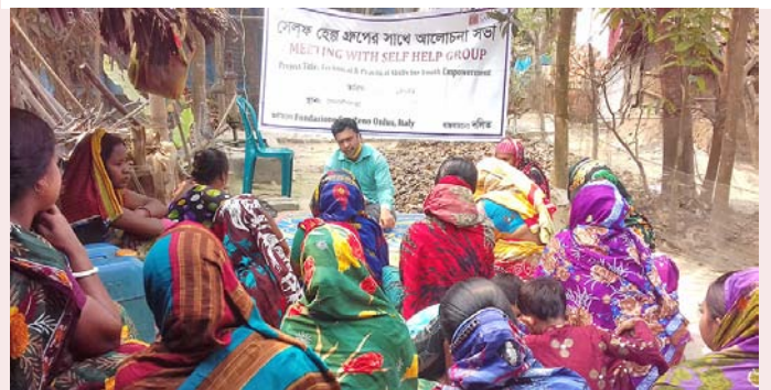
Meeting of Self-help group