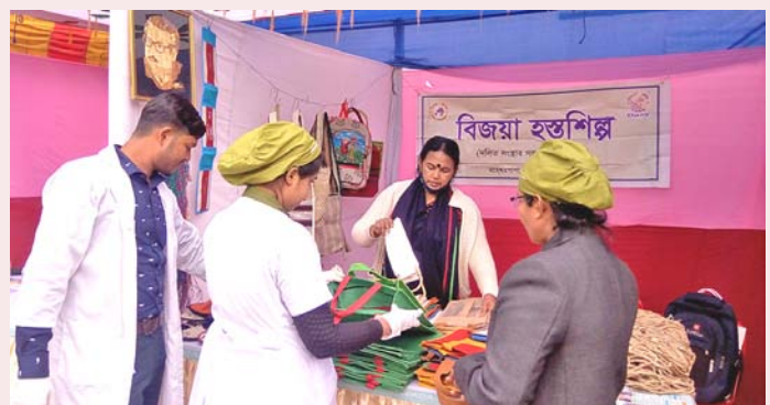
Stall of Bijoya in a fair