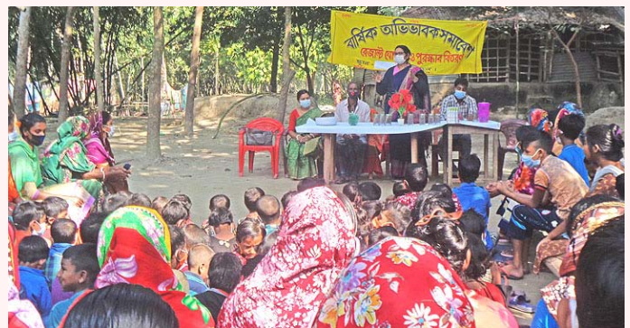
Annual parents meeting