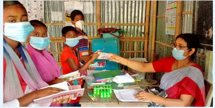
Distribution of monthly stipend