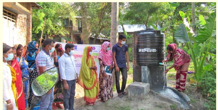
Disinfectant corner at the community level