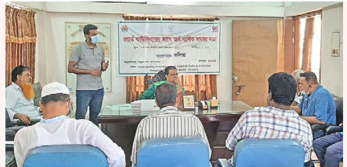
Advocacy meeting with Ward Councillor