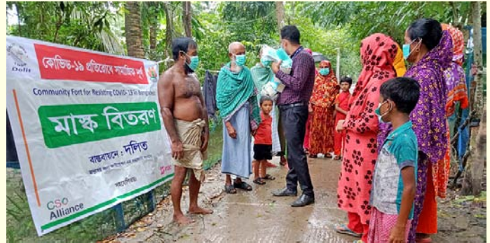
Mask distribution to the villagers