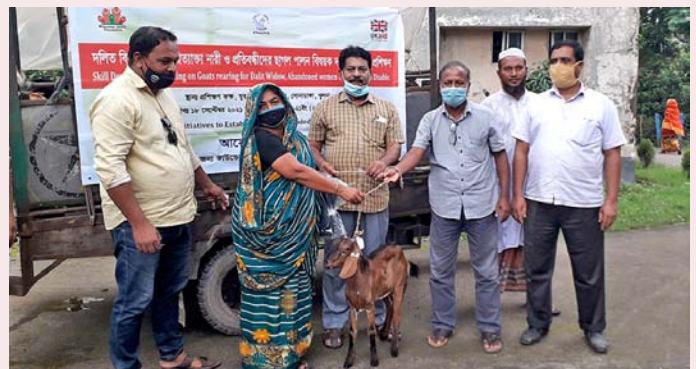
Distribution of goat