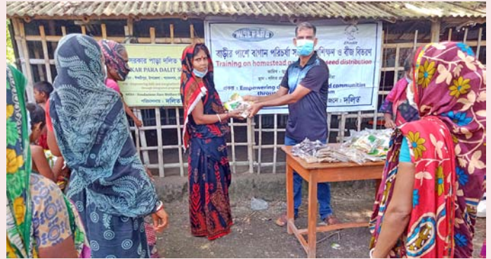
Distribution of vegetable seeds