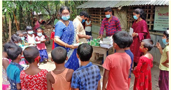
Soap & mask distribution to the students