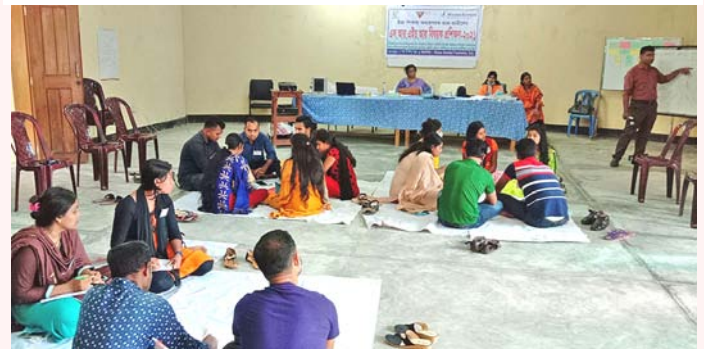
Training on SRHR