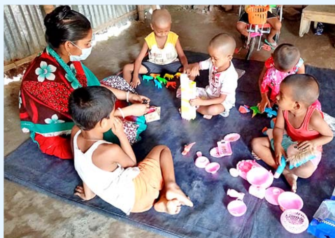
Child care centre in Moheshwarpasha, Khulna