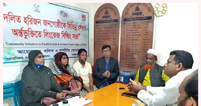
Linkage building meeting