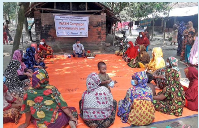
WASH campaign at community level