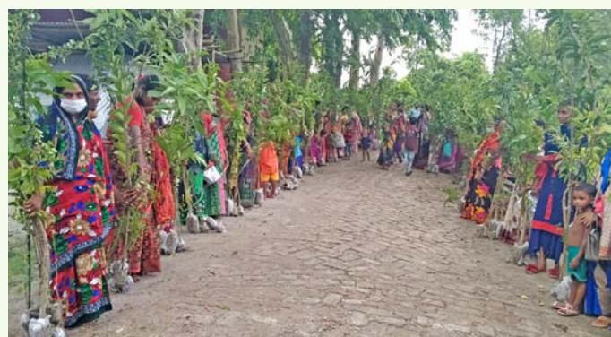
Distribution of medicinal plants