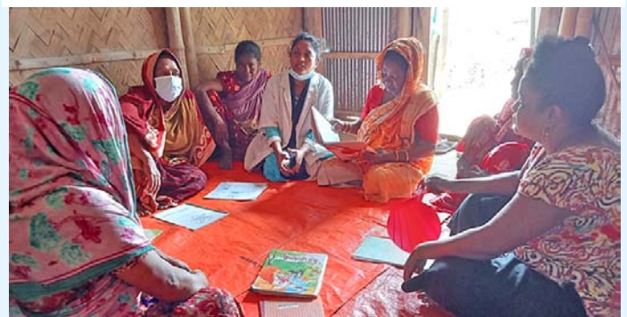
Aged learning centre