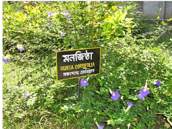
Medicinal plants garden

Dalit aimed to improve the health conditions of the poor villagers (especially mothers and children) living in rural areas by providing low cost (Ayurvedic) treatment. The curative treatment is always costly. Ayurvedic treatment is cost effective, attainable and side effect free. That is why Dalit introduced Ayurvedic treatment in its services. People of all concern and the statistics proved that Ayurvedic treatment become familiar than the Allopathic.