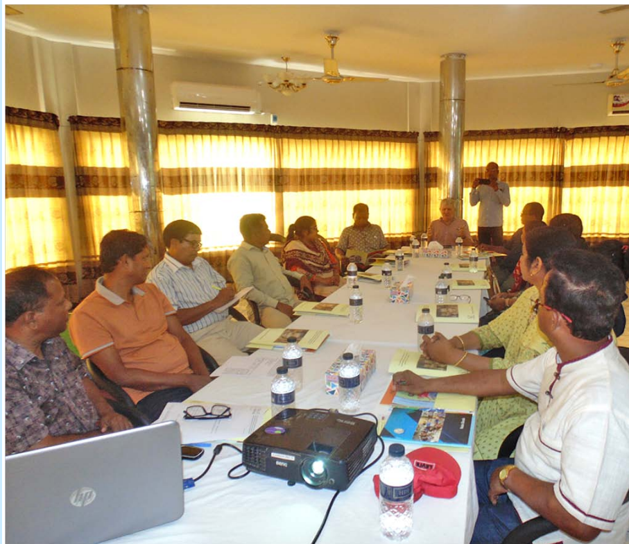
Dalit's General Committee Meeting